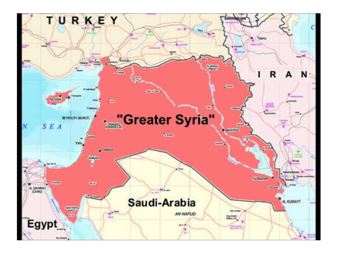
Annex 1: A Map of Greater Syria