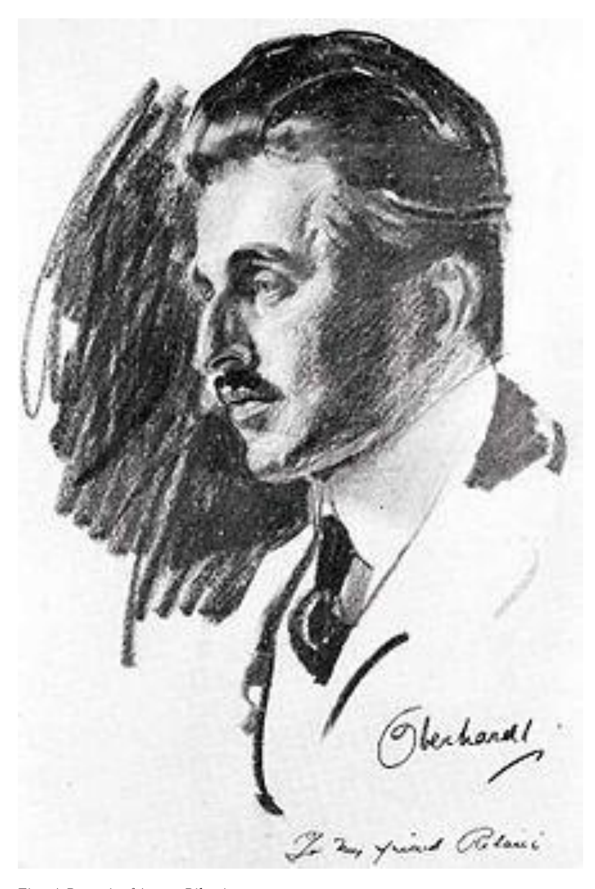
Fig: A Portrait of Ameen Rihani